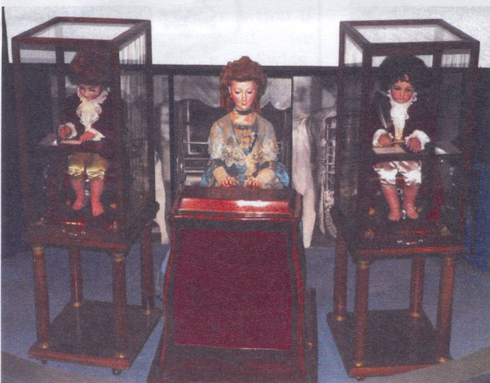
The draughtsman, the writer and the musician by Pierre Jaquet-Droz

The star attractions of this museum are the three mechanical figurines built to the most exacting technical standards by a Neuchâtelois watchmaker in the 1770s and still in perfect working order today. The three – the Draughtsman, the Writer and the Musician – are displayed static behind glass, with a fascinating accompanying slide-show in English by way of explanation, but if you can you should really time your visit for the first Sunday of the month, when they are brought to life for a demonstration. The Draughtsman is a child sitting at a mahogany desk and holding a piece of paper with his left hand; his right hand, holding a pencil, performs extraordinarily complex motions to produce intricate little