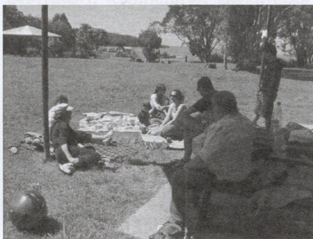
Beach party at Cornwallis Beach

Beach Party Sunday 1 November - Our Beach Party started rather grim and drizzly, but come lunch time the clouds disappeared and we enjoyed the