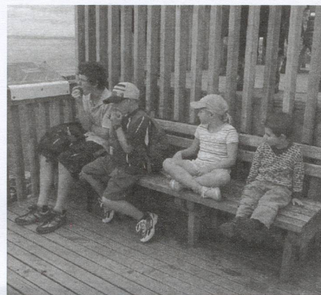
Fit youngsters enjoying a break