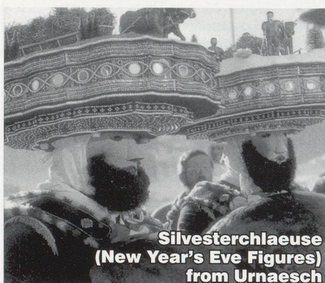
Silvesterchlaeuse (New Year's Eve Figures) from Urnaesch