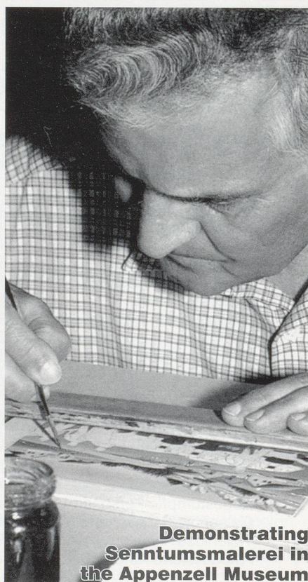
Demonstrating Senntumsmalerei in the Appenzell Museum