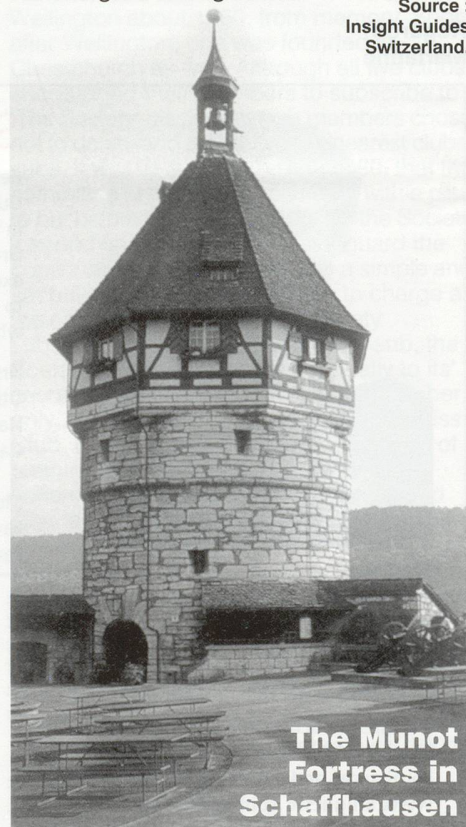
The Munot Fortress in Schaffhausen