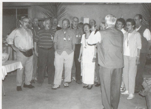
The Swiss Shooters with their special contribution to the entertainment.