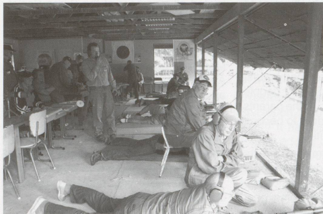
Shooting in progress

A highlight for the Auckland Shooting section was a visit by the Swiss Senior Shooting Federation on March 20, 2004.