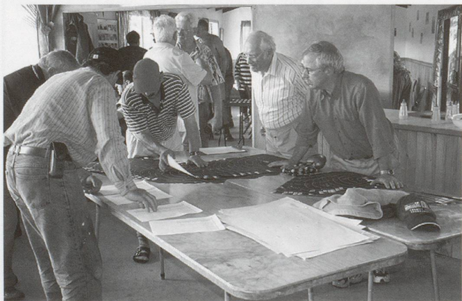
Finding a winner