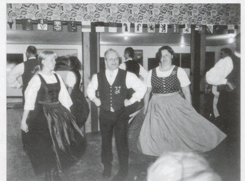
Some of the lovely costumes worn by ETUI members.