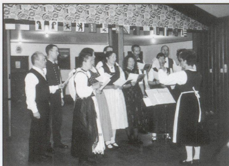
The ETUI singers performing a lovely number.

The members of ETUI are from different European countries. They got together after having attended a convention some time ago. They practise once a month in Stuttgart ... some members travel up to 500km to attend!!! Before embarking on this tour, they practised the three weekends prior to departure ... what a lot of travelling! The group have travelled to different parts of the world on various occasions.