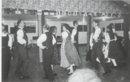
Members of the trachtentanz group in action.

On October 31 we hosted a group from ETUI (European Tanz Union) who boasted members from Germany (the main contingent in the group), Austria and Switzerland. They were touring New Zealand and wanted to perform at different venues, so they showed their talents at the Wellington and Taranaki Swiss Clubs, and were hosted by the Bohemian Society in Auckland and Hamilton. They presented items of dancing (trachtentanz) from various European countries, singing and music. Some of the trachtentanz performed