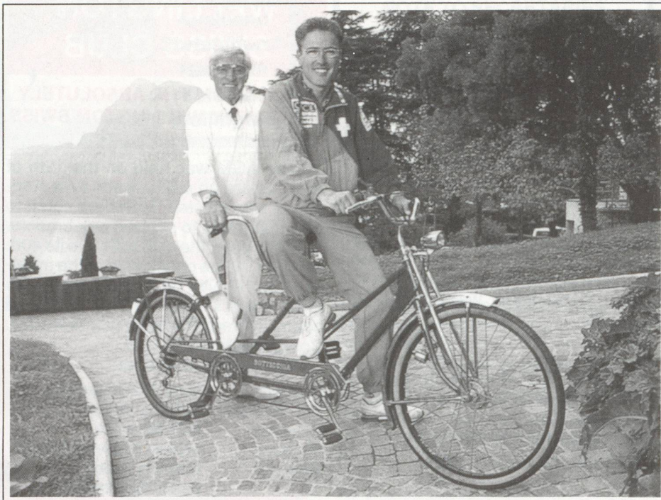
The two World Champions in tandem. Of course Alex Zülle is in front.

When the Swiss Alex Zülle recently became World Champion cyclist in the time trial, the first to congratulate him on his success was no other than Ferdy Kübler who had won the same trophy some 45 years ago in Varese, Italy.