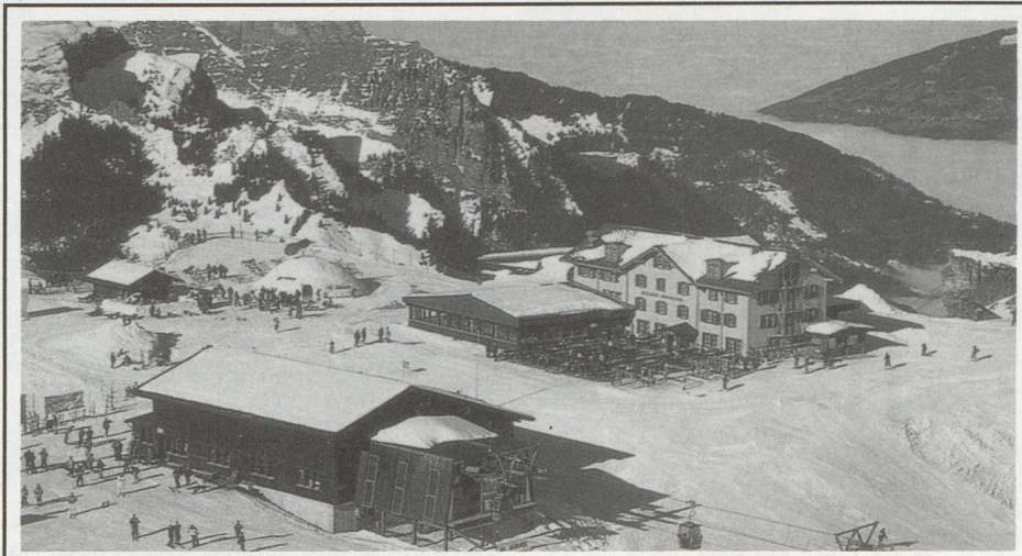
View of the Männlichen, high above Wengen. In the background, the uniform grey cloud covering the Lake of Thun and for that matter the whole of the Swiss plateau.

All of you who lived in Switzerland and had to spend your winters down on the "flat land" will remember the horrible grey winter weather which seemed to last for weeks on end when all you could see was a uniform grey layer of clouds which never let any real sunshine through. It certainly was most depressing.