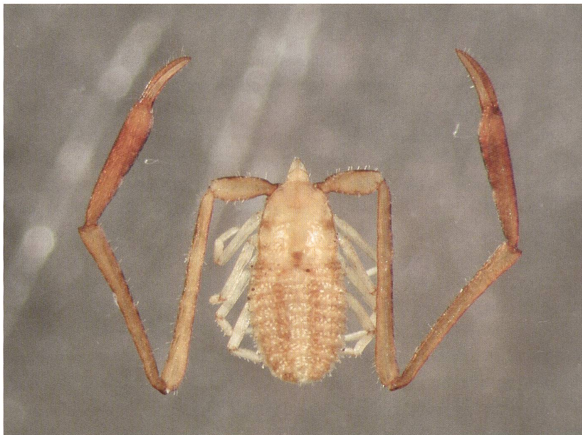
Fig. 1. Habitus of Attaleachernes thaleri gen. nov., sp. nov.