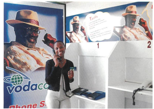
Billing is a crucial component of an m-commerce system.

At a more prosaic level, but arguably no less critical, is the need for operators to unlock the real value of prepaid users. Achieving this is contingent on capturing prepaid customers' details and records of their transactions, without which it is very difficult to sell additional services and increase ARPU for this type of customer. And the issue of "pricing" per se is one that will have to be resolved