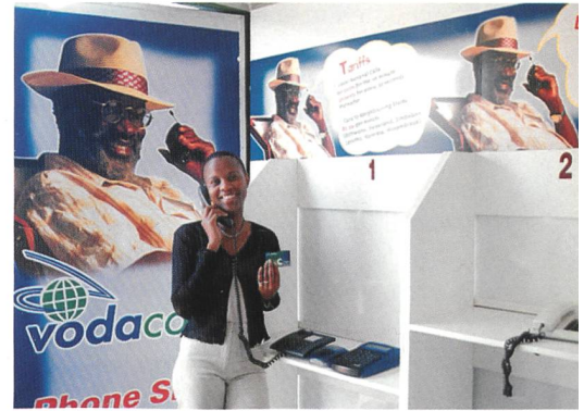
Billing is a crucial component of an m-commerce system.

At a more prosaic level, but arguably no less critical, is the need for operators to unlock the real value of prepaid users. Achieving this is contingent on capturing prepaid customers' details and records of their transactions, without which it is very difficult to sell additional services and increase ARPU for this type of customer. And the issue of "pricing" per se is one that will have to be resolved