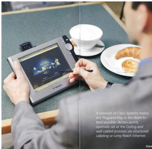
A network of Cisco Systems makes this Plug-and-Play in the Hotel Estel possible. Access points, optimally set at the Ceiling and well cabled accesses via structured cabling or Long Reach Ethernet.

Usually, access will be on a subscription basis, or via a prepaid scratch card or credit card account. Authentication is most often based on the RADIUS (Remote Authentication Dial-in User Service) standard, using a username and password. There are at present thousands of hotspots around the world, and these are increasing at a rate of knots. Aside from the often referenced hotels, cafes and convention centres, 802.11 is facilitating broadband access in many other locations, such as around phone booths in the United Kingdom, and even an outdoor public plaza in Australia.