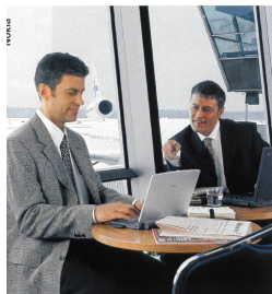
Hotspots roll out across the maturing wireless marketplace.

IIR's Billing Systems 2003 13 th – 16 th May 2003 Earls Court Conference & Exhibition Centre London Web: www.iir-billingsystems.com Email: billing@telecoms.iir.co.uk Tel.: +44(0)20 7915 5600