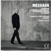
PAAVO JÄRVI: "Messiaen", Tonhalle-Orchester, Zurich Alpha 2019

Why? Paavo Järvi, the new chief conductor of the Tonhalle Orchestra Zurich was expecting this question. "Because I am an Olivier Messiaen fan," he replies nonchalantly. "It's great music, and it gets played far too rarely. We have now released a small collection of masterpieces on CD."