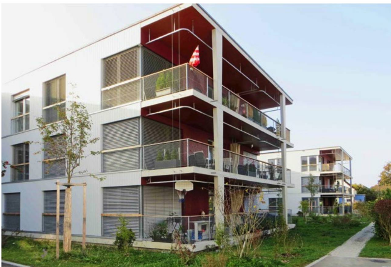
The Brüggliäcker estate in Schwamendingen, created by a housing cooperative, is adjacent to a conventional district of detached houses.

Bassand dedicated his doctorate to the question of the "depth" of buildings. This compact way of building, deriving from certain mediaeval structures, was abandoned in the 20 th century, resulting in thin and spaced housing blocks, which addressed the hygienist concerns of town planning. This depth returned at the turn of the century in Switzerland, with denser and wider buildings. The lecturer at the HEPIA cites the Schürliweg building, in Affoltern (ZH) as an example, with a thickness of 38 metres, and a block with a depth of 19 metres, erected in the Hardturm neighbourhood of Zurich-West, which includes collective flats with 13 rooms.