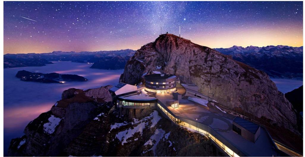
The Hotel Pilatus Kulm beneath a starlit sky in an advert for the Pilatus Railway

holidays in the Bernese Oberland from 1879. Many of his paintings of the Alps were produced here and he often used the same routes and viewing points as the tourists. He explored the area around Interlaken on transport links which were new at the time. The cog railway up to the Schynige Platte took him to the "view of Lake Thun and Lake Brienz", and when the mountain railway from Lauterbrunnen up to Mürren opened in 1891, it provided access to a new attraction not just for tourists but also for the artist – the postcard subject of the "Jungfrau". Hodler paid his first visit here in 1895 and then returned in the summers of 1911 and 1914. During those two seasons, he painted the Jungfrau massif in a total of thirteen different works. There are, of course, differences in terms of colour, contrast, texture and atmosphere. However, one thing does not change in the thirteen versions. Hodler stood in the same spot as the tourists and painted different paintings from various railway stations. He used the railway to frame the Jungfrau as he wished.