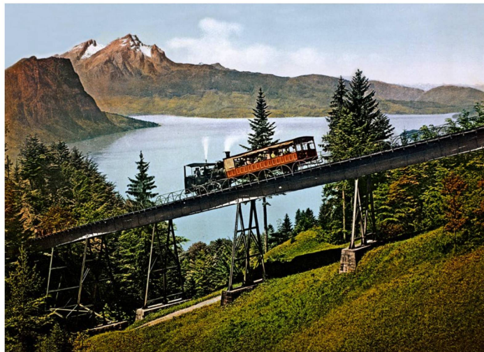
Vitznau's steam-powered cog railway up the Rigi on a colour postcard, circa 1900

Let's take Ferdinand Hodler, for example. This painter, who died exactly one hundred years ago, regularly took