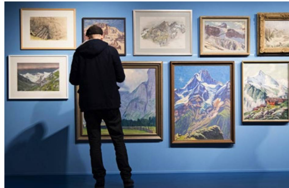
From the exhibition at the Alpine Museum in Berne

Mark Twain gave an account of what could be experienced there besides the legendary sunrise and the no less infamous hordes of tourists eagerly anticipating it. In 1879, the American writer climbed the Rigi on foot from Weggis and soon heard "for the first time the famous alpine yodel