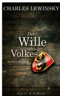
CHARLES LEWINSKY: "DER WILLE DES VOLKES". Nagel & Kimche, 2017. 384 pages, CHF 27.90, EUR 24.

Kurt Weilemann is a retired old-school journalist for whom professionalism meant in-depth research and a correct use of language. The times have changed and he is now surplus to requirements. One day, Derendinger, a former colleague, asks to meet him. Derendinger seems so confused that Weilemann suspects he might be ill. But when Derendinger is found dead a few hours later, Weilemann quickly realises that it couldn't possibly have been suicide, as is officially claimed. His curiosity is aroused and he is egged on by Eliza, a young friend of the deceased. When he starts researching the case, he stumbles across a potentially explosive