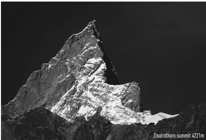
Zinalrothorn summit 4221m