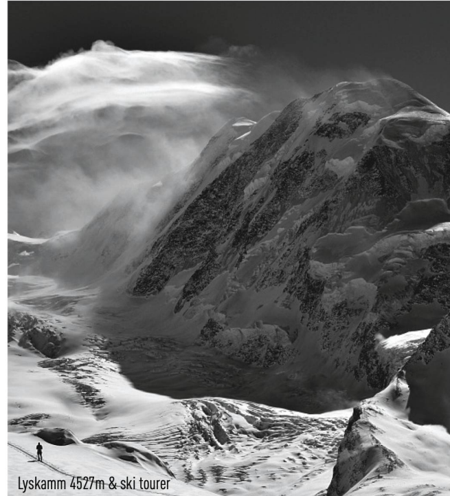
Lyskamm 4527m & ski tourer