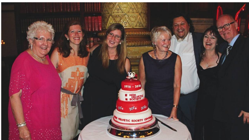
NHS committee celebrating the Centenary of the club in London.

MEMBER OF THE COMMITTEE AND TREASURER OF NHS