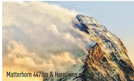
Matterhorn 4478m & Hornliweg