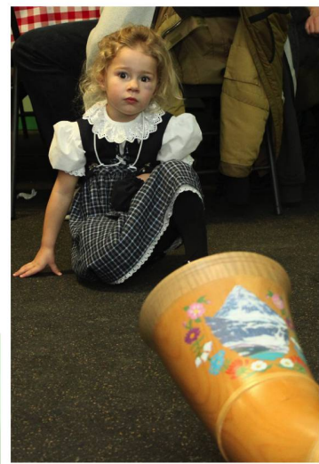
Edmonton Swiss Society family events of 2017