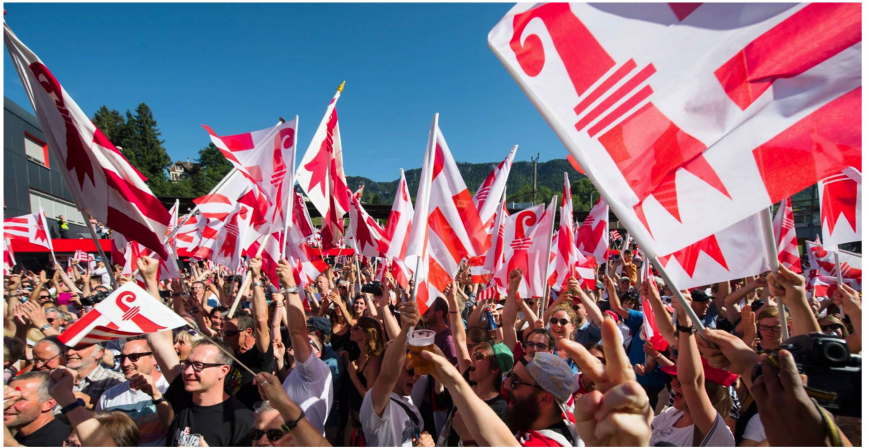
Joy among Pro-Jura residents: Moutier was at the heart of the Jura conflict for decades. Last June there was finally cause for celebration – at least for those in favour of switching canton.