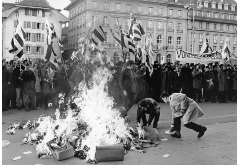
Violent times: Jurassian separatists at an unauthorised demonstration in November 1969 in front of the Federal Palace of Switzerland in Bern.

2012: The cantons of Bern and Jura reach an agreement to end the Jura conflict once and for all. The agreement provides for a multi-stage procedure with regional and local referendums.