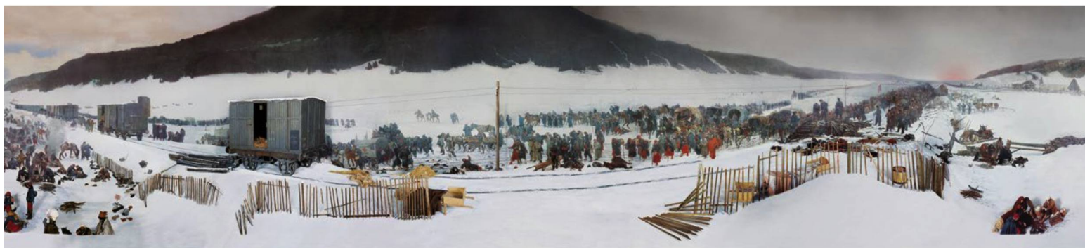
Lucerne's Bourbaki Panorama in all its splendour: Edouard Castres' cyclorama is 112 metres in length.

panorama of Thun created between 1809 and 1814 is the oldest preserved panoramic painting in the world and Switzerland's first. The Bourbaki painting is an unusual unique piece of art in the context of the panorama production of its era. It does not glorify heroic military deeds and victorious battles, as was customary at the time, but instead focuses on a defeat and represents a denouncement of war.