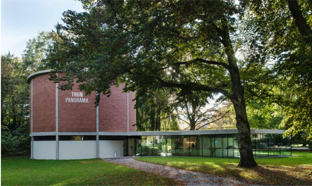
The 7.5-metre-high and 38-metre-long panorama by Marquard Wocher is housed in Thun.

under a private initiative, the painting was housed in an open shed belonging to the municipal building control office. It was not until 1961 that the panorama was put on public display in a brick-built rotunda in Thun's Schadaupark.