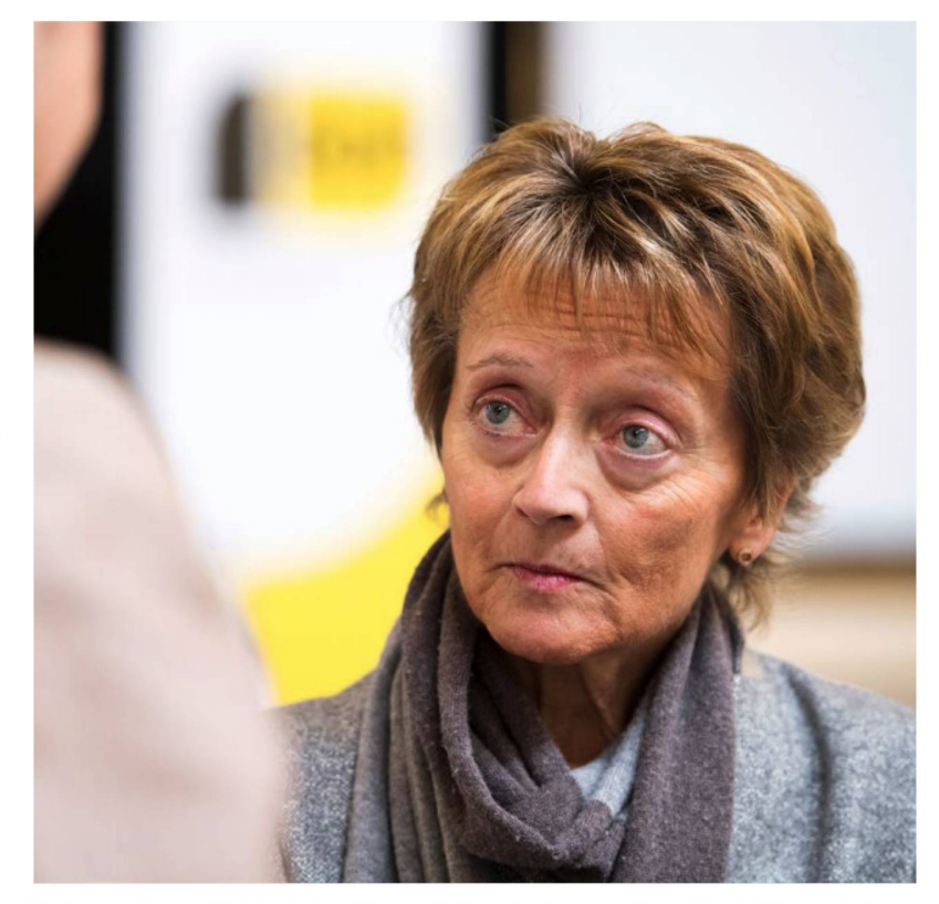
The former Finance Minister Eveline Widmer-Schlumpf, effectively the architect of Corporate Tax Reform III, pictured at a meeting of BDP delegates, voiced criticism of the tax bill three weeks before the referendum.

The left emerged victorious from the bitter struggle. The bill was defeated by a surprisingly clear margin, with 59.1% opposed. This was surprising