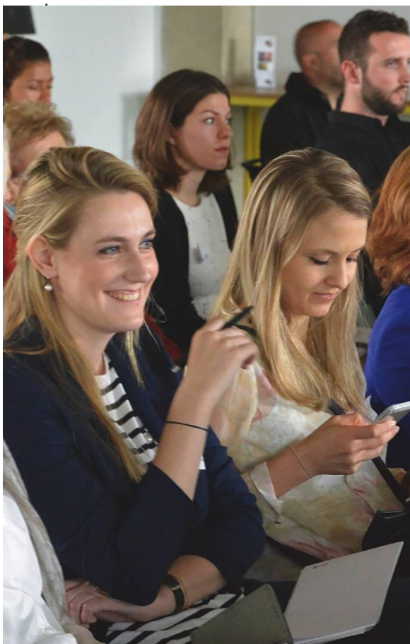
Candidates waiting for the result