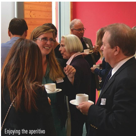
Enjoying the aperitivo