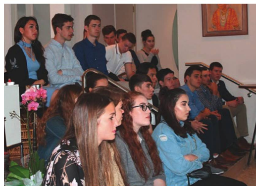
Young adult Swiss at the Consulate General of Switzerland