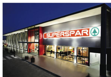
Spar South Africa investing in Switzerland.