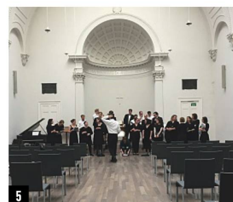
3. A beautiful and elegant wedding venue