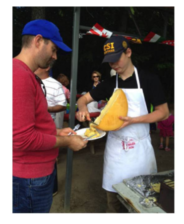
Toronto Swiss Club Toronto

Directions from Toronto: Country Heritage Park is located on 8560 Tremaine Rd., west of Milton. Take Hwy 401 west to Hwy. 25. Exit and go north to the third traffic light. Turn left onto Side Road 5/Regional Road 9. After three kilometers turn left onto Tremaine Road (hidden intersection). Go over the 401 bridge and the Park is immediately on the right. For more information: www. swissclubtoronto.ca. For Park information: www.countryheritagepark.com. SASCHA FRASSINI