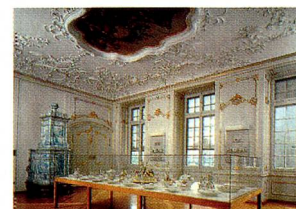
"Zur Meisen" Guild House, Zurich