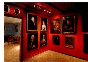
Bäregasse Museum, Zurich

The Swiss Confederation not only supports the eight institutions that make up the Musée Suisse group, but owns a total of 15 museums itself. The state also supports another 70 museums, for which no fewer than five departments and eleven federal offices are responsible. Because there is strictly speaking no museum policy, parliament has commissioned the Federal Council to draw up a binding strategy by 2007.