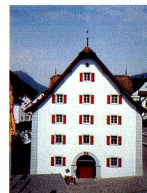
Forum of Swiss History, Schwyz