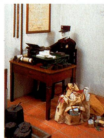
Customs Museum, Gandria