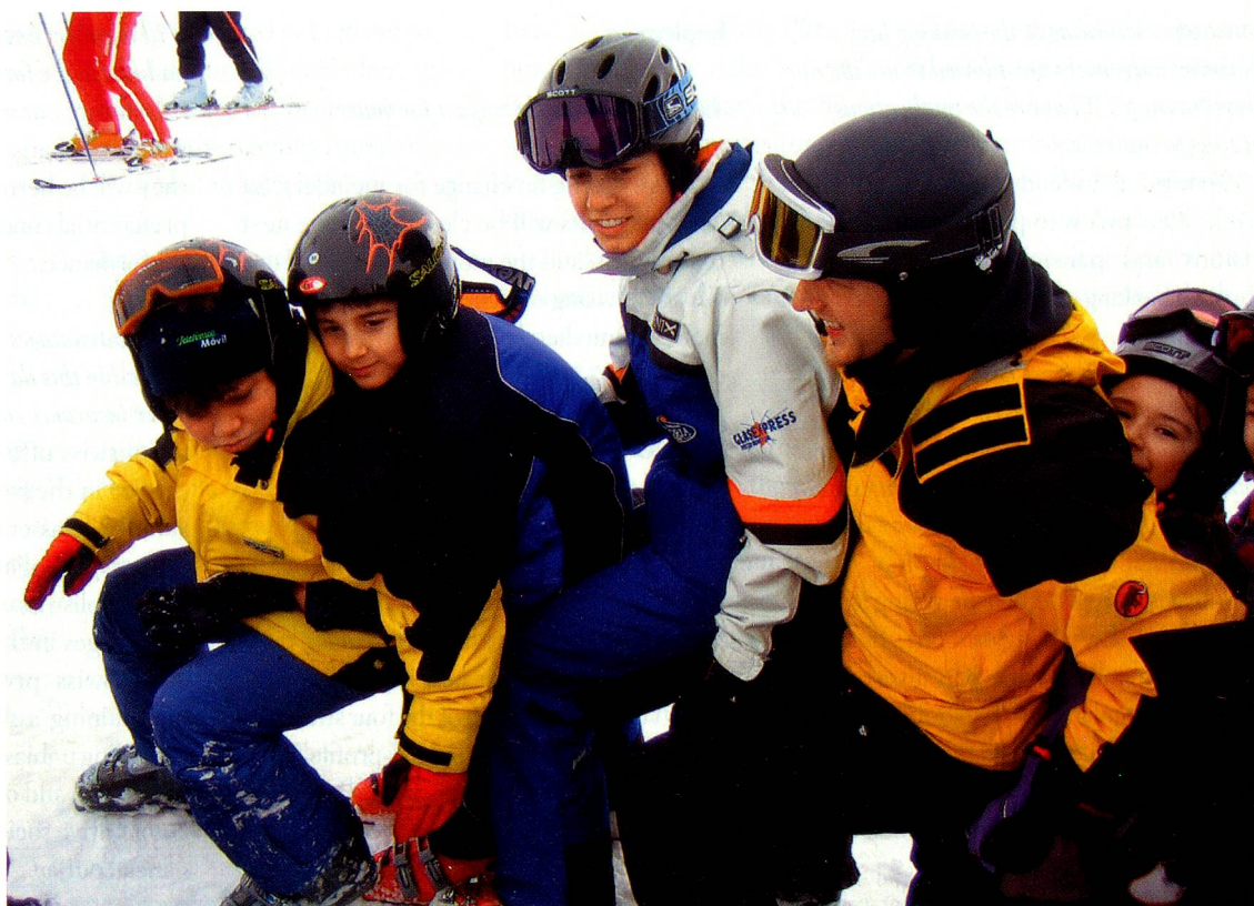
FYSA winter camp in February 2006.

Foundation for Young Swiss Abroad Alpenstrasse 26 CH-3006 Berne Tel.: +41 (0)31 356 6116 Fax: +41 (0)31 356 6101 E-mail: sjas@aso.ch www.aso.ch ("Youth", "Holiday camps for 8- to 14-year-olds", "Program Winter")