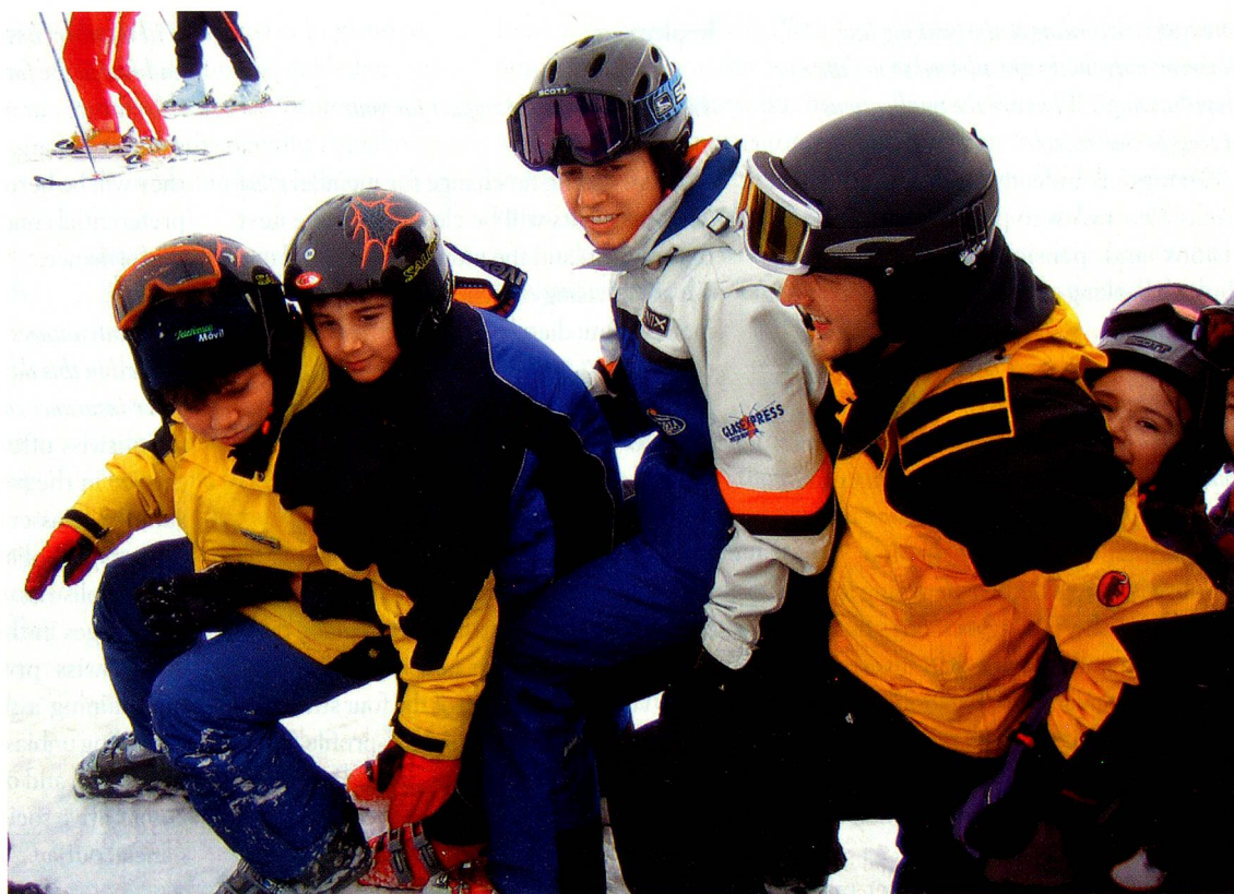
FYSA winter camp in February 2006.

("Youth", "Holiday camps for 8- to 14-year-olds", "Program Winter")