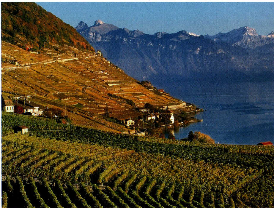
Fascinating Lavaux: view to the East

The three suns of Lavaux The picturesque viticultural region of Lavaux is situated between Lausanne and Montreux. The terraced vineyards at the foot of the Alps on the shore of Lake Geneva, nestling in a landscape blessedly free from urbanisation, are home to some noble wines – reason enough for the citizens of Lavaux to submit their region for inclusion on the UNESCO list of World Heritage Sites. By Alain Wey.