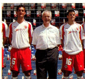
Köbi Kuhn, National Coach