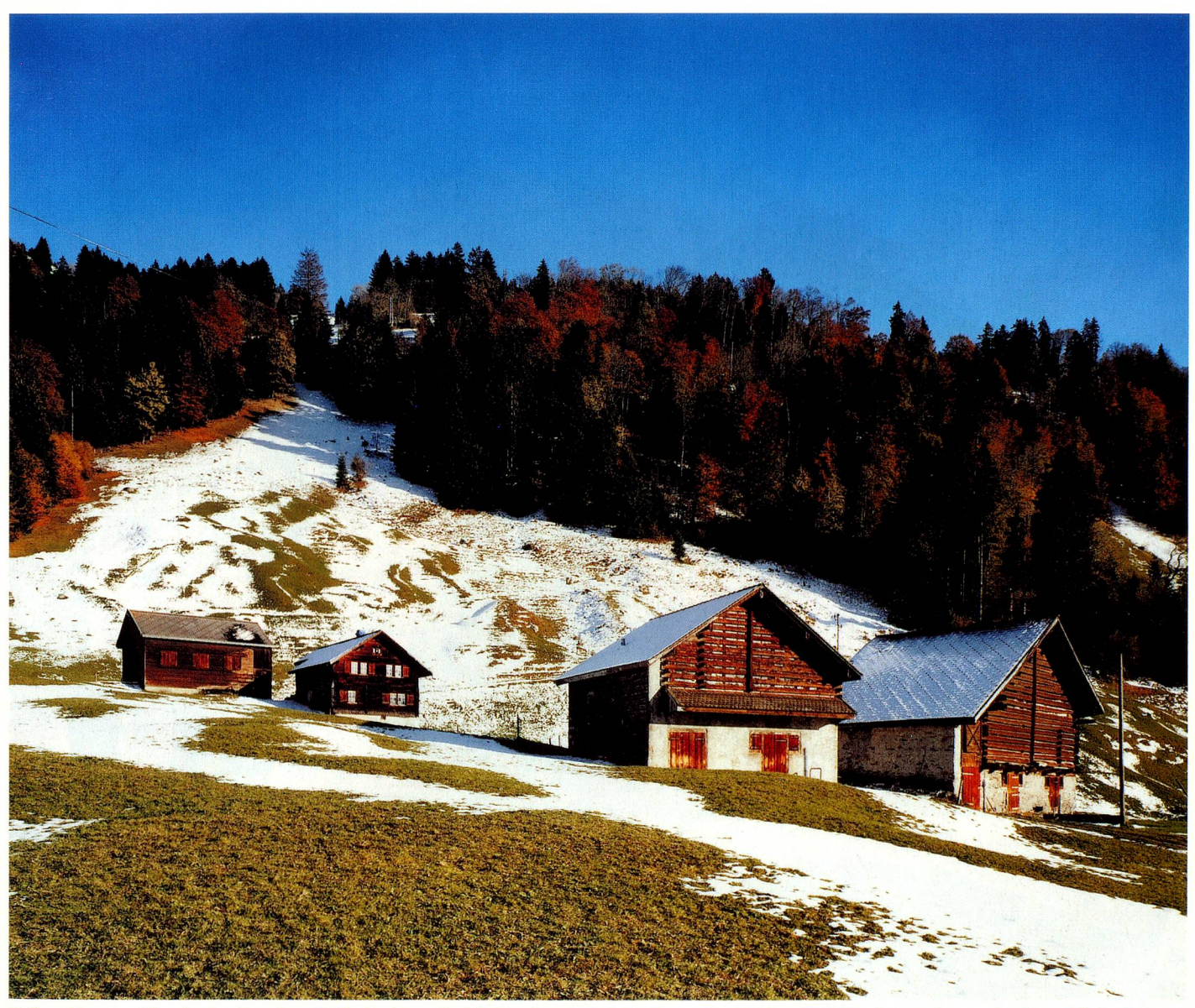
Stalls and house, artillery bunker, Ennetberg GL: The bunker on the left dates from 1979, the bunker on the right from 1980.

Tank, armoured infantry and tank sapper battalions as well as artillery units will be