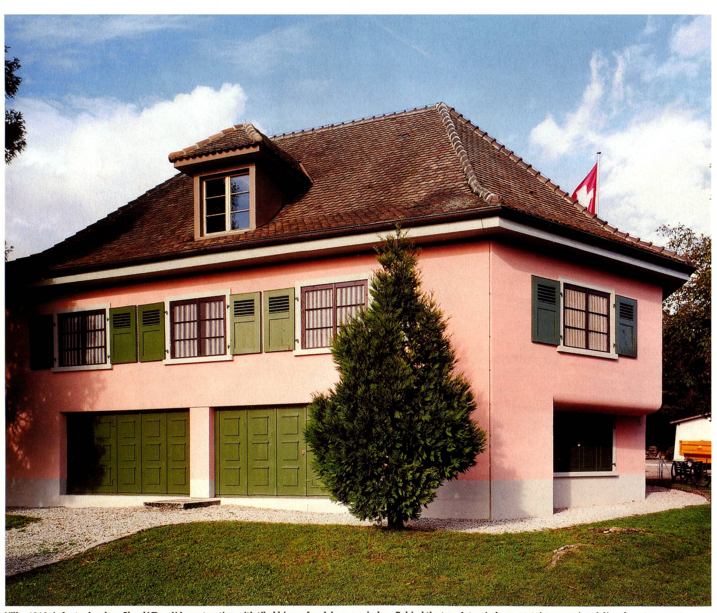
Villa, 1940, infantry bunker, Gland VD: solid construction with tiled hip roof and dormer window. Behind the template windows, curtains are painted directly onto concrete. The bunker is now used as a museum.

move to increase capacities for deployment abroad. The FDP even calls for this instrument to be further expanded, arguing that peace-building operations abroad could prevent migration movements and stem the flow of asylum seekers. In terms of defence costs, the FDP urges that priority be given to funds for high-tech reconnaissance, communications and control systems for defence applications. P.A.