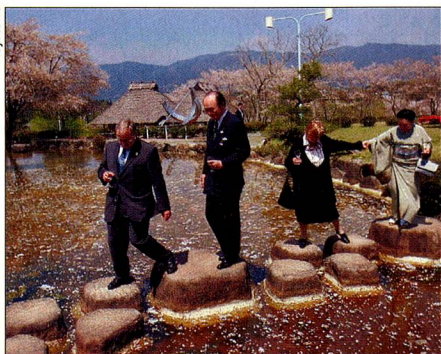
Federal President Schmid at the World Expo.

today's Swiss culture in a fitting manner. On 16 April Federal President Samuel Schmiel is guest of honour in the "Wisdom of Nature" pavilion, where about 15 million visitors are expected until the end of September.