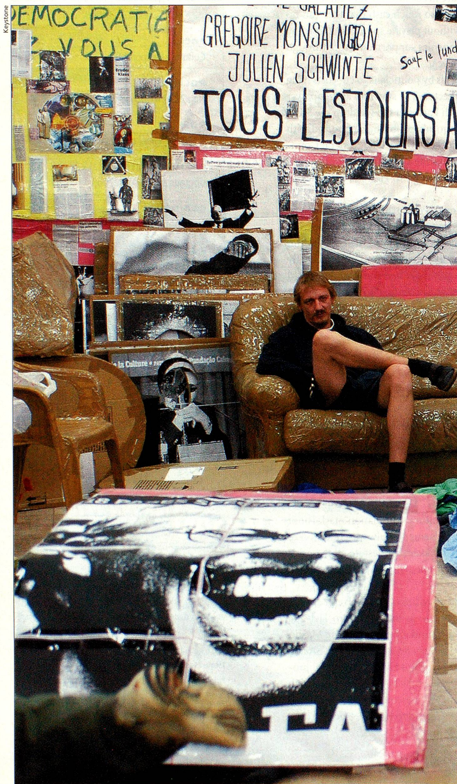
Performance and provocation: Hirschhorn art with actor.

Around the world there is major interest in culture and artists from Switzerland. The Pro Helvetia cultural foundation plays a key role as a cultural intermediary whose aim is to promote intercultural understanding.