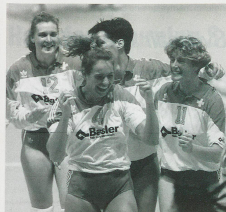
Reason to celebrate: the Swiss women's volleyball team...