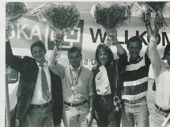
...and the same goes for the horse-jumpers.

tor sports. But of course we need more than that to bring our sportsmen and sportswomen up to the top professional level. An analysis has shown that in Switzerland today sport generates between 16 and 18 billion francs. Nowadays gym shoes are worn wherever people go, and not just for sport. Sport influences fashion, and it's mixed up in the hotel trade. So there is no harm in business making a substantial contribution, so that sport – which is used so much in advertising – continues to be promoted and encouraged to an ever greater extent.