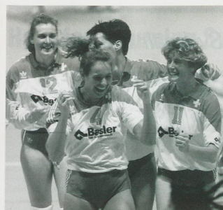
Reason to celebrate: the Swiss women's volleyball team...