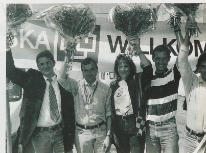
...and the same goes for the horse-jumpers.

tor sports. But of course we need more than that to bring our sportsmen and sportswomen up to the top professional level. An analysis has shown that in Switzerland today sport generates between 16 and 18 billion francs. Nowadays gym shoes are worn wherever people go, and not just for sport. Sport influences fashion, and it's mixed up in the hotel trade. So there is no harm in business making a substantial contribution, so that sport – which is used so much in advertising – continues to be promoted and encouraged to an ever greater extent.