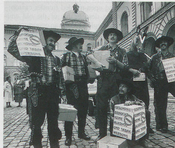
Tobacco and alcohol advertising damages public health, or so said the initiators as they handed in their list of signatures.

In addition, doubts are manifested as to the benefits for public health if an advertising ban is passed. The government also makes the point that even if the initiatives were accepted, tobacco and alcohol advertising would continue to be present in foreign publications sold here, and on foreign radio and TV stations. A ban would disadvantage not only domestic producers of alcoholic beverages, it would also hit newspapers and magazines who profit considerably from alcohol and cigarette advertisements. The government and parliament maintain that the negative consequences of an advertising ban outweigh the understandable but disputed alleged positive effects towards lower alcohol and tobacco consumption. They also add that total advertising bans do not fit into