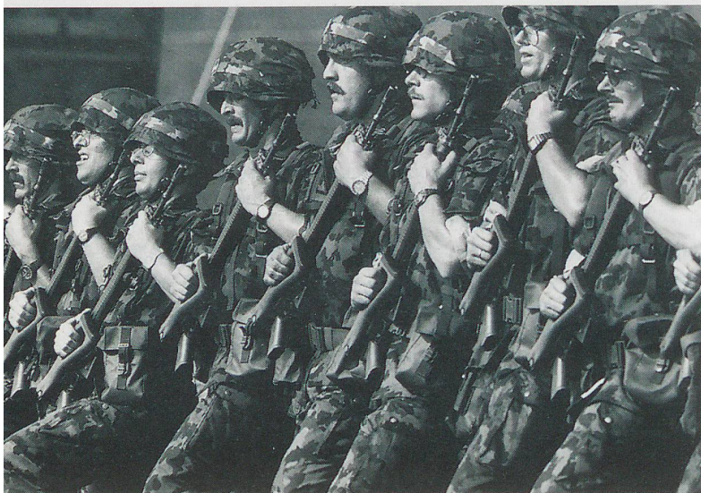
The Army '95 concept includes a careful combination of work...