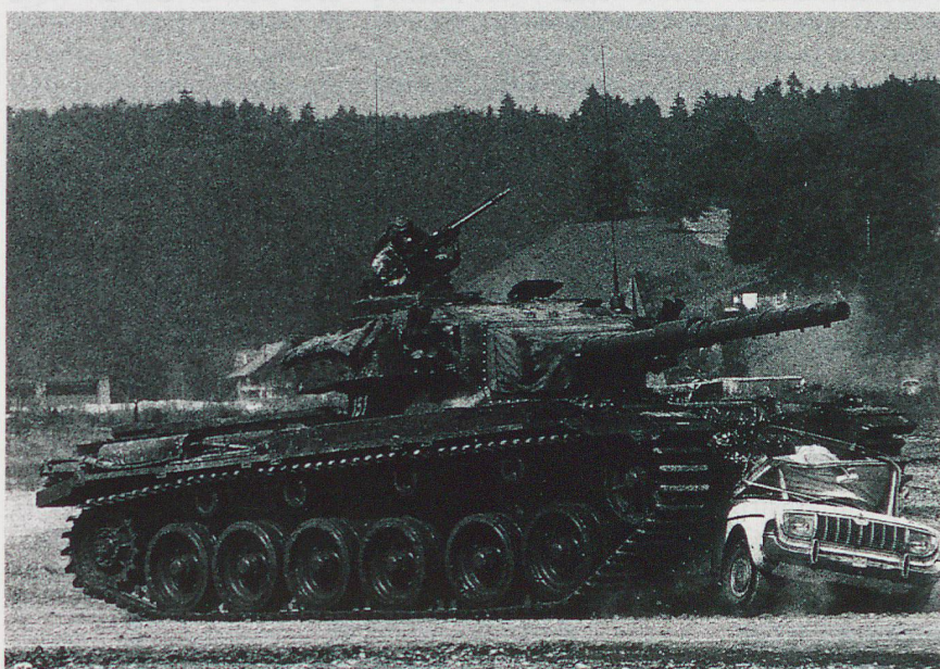
For increased flexibility: the three mechanised divisions will be turned into five tank brigades.