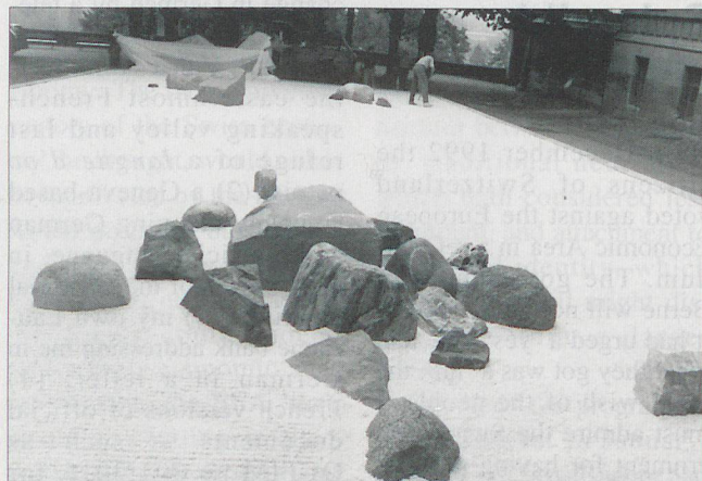
Das Gleichgewicht der Dinge (The Balance of Things) – as reported in the last edition of the Regional News-UK, the stone sculpture in Berne made from rocks collected at locations called Switzerland throughout the world

More than a dozen resorts have made major improvements to existing mountain facilities, taking care to min-