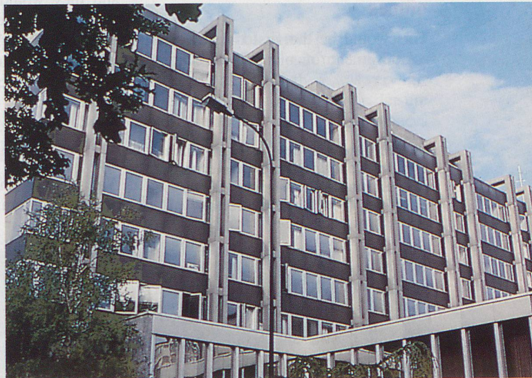
Geneva shelters many international organisations. From left to right: the UN building, the World Health Organisation (WHO), the World Intellectual Property Organisation (WIPO), and EFTA.