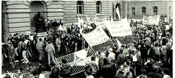
Swiss farmers protest the growing threat to their subsidies.

tives cannot conceal the fact that restructuring is bound to take place in Swiss agriculture, as in that of other European countries. This is due not only to the hoped-for GATT agreement but also to the opening up to the rest of Europe which is bound to take place in the long run in the framework of the European Economic Area.