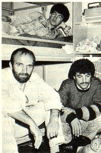
Hoping for a better future.

This book can be ordered from: Secretariat for the Swiss Abroad, Alpenstrasse 26, CH-Berne 16. No charge for postage.