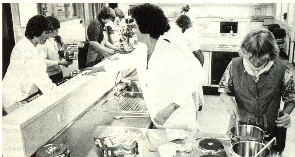
During certain lessons, teachers prefer the dialect as an intimate language to the standard German with "gentrified" overtones.

Already before the outbreak of the First World War ("The Great War") in 1914 the first strong counter-movement against this cultural infiltration by foreign elements (known in German as "Überfremdung" and as "noyautage" in French) started in Berne and quickly gained prominence all over German Switzerland after the defeat of the Reich. In the post-war period, with its emphasis on democracy and federalism, for both of which concepts the various cantonal dialects could be seen as symbols, this trend became stronger, and even more so in the WW II era of "spiritual defence of our country", when it was even encouraged by the State authorities as a bulwark against National Socialism. After this second pro-dialect movement, there followed a period of calm until in the early 1960's, when the German-Swiss awoke from their period of lethargy, with Frisch and Dürrenmatt again making