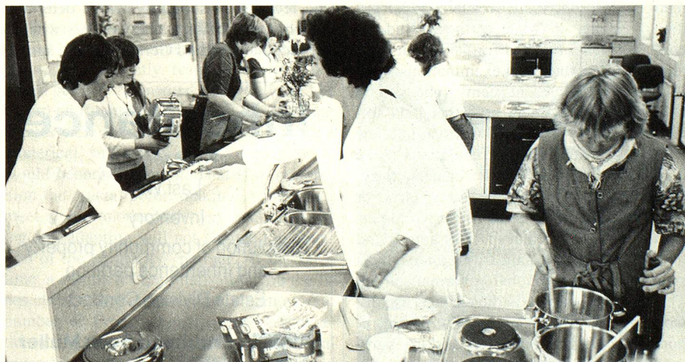
During certain lessons, teachers prefer the dialect as an intimate language to the standard German with "gentrified" overtones.

Already before the outbreak of the First World War ("The Great War") in 1914 the first strong counter-movement against this cultural infiltration by foreign elements (known in German as "Überfremdung" and as "noyautage" in French) started in Berne and quickly gained prominence all over German Switzerland after the defeat of the Reich. In the post-war period, with its emphasis on democracy and federalism, for both of which concepts the various cantonal dialects could be seen as symbols, this trend became stronger, and even more so in the WW II era of "spiritual defence of our country", when it was even encouraged by the State authorities as a bulwark against National Socialism. After this second pro-dialect movement, there followed a period of calm until in the early 1960's, when the German-Swiss awoke from their period of lethargy, with Frisch and Dürrenmatt again making