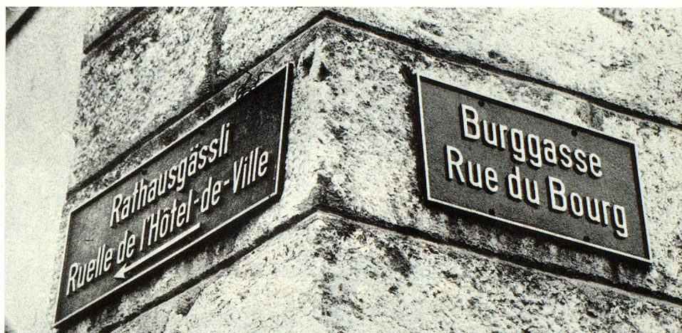
In the bi-lingual town of Biel/Bienne, even the types of syllabus and the dates for the holidays are different.

French-speaking Switzerland is made up of various and widely differing sectors. Every canton in the region has its own history, its distinctive individual character. Thus in the Valais, the dominating factor is the geography, with its high mountains and deep valleys. The locality with the highest annual rainfall lies cheek-by-jowl with the driest district in Romandie (and in the entire country for that matter). Throughout the whole of the Jura, one senses the living consciousness of the region’s chequered past history. And in the Neuchâtel countryside the spirit of technical inventiveness is ever present: already in the 18th century Pierre Jacquet-Droz built automata in near humanoid form, the precursors of the robots of today. A famous son of the same canton was Le Corbusier, born in La Chaux-de-Fonds.