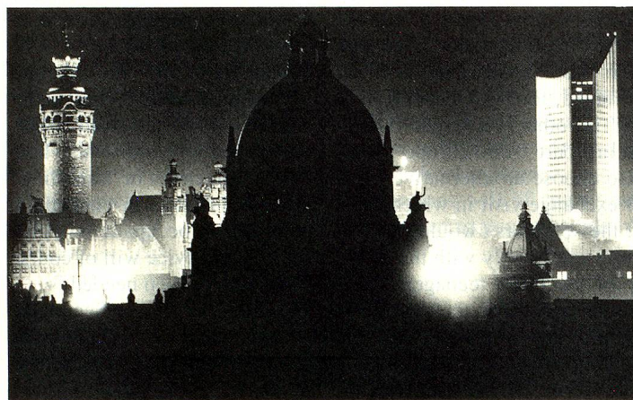
The account-keeping GDR financial institutions will convert national foreign currency accounts into DM on request. Picture: Leipzig by night

As part of the financial reforms in the GRD, the West German mark (the DM) became the official currency of the GDR as from July 1 1990.