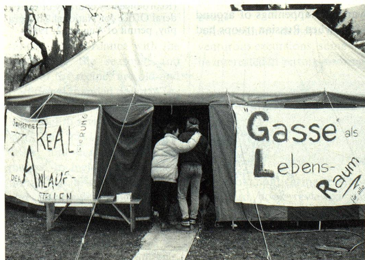
Berne's Kleine Schanze, where a heated tent provides temporary relief from the miserable life of drug addicts