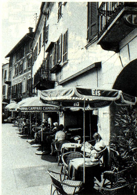
More «Eis» than «gelati» in Morcote? Advance of the German language in Ticino.