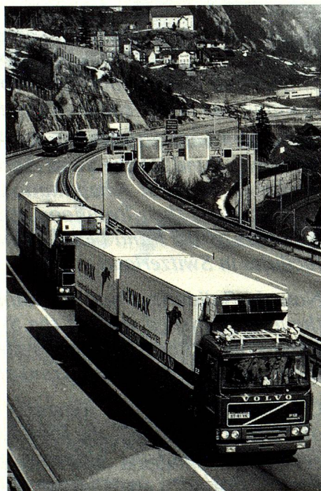
Most of the road goods traffic trundles over the Gotthard route.

According to figures of the Federal Administration, the main flows of transalpine lorry journeys were from France, with 35%, and from Austria, with 41%. Yet, since the Gotthard road tunnel was opened in 1980,