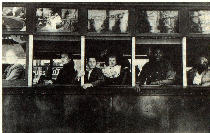
Robert Frank, New Orleans, 1955–1956