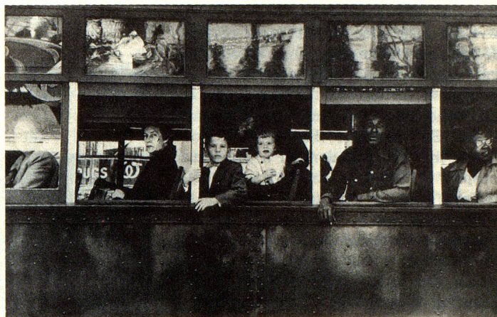
Robert Frank, New Orleans, 1955–1956