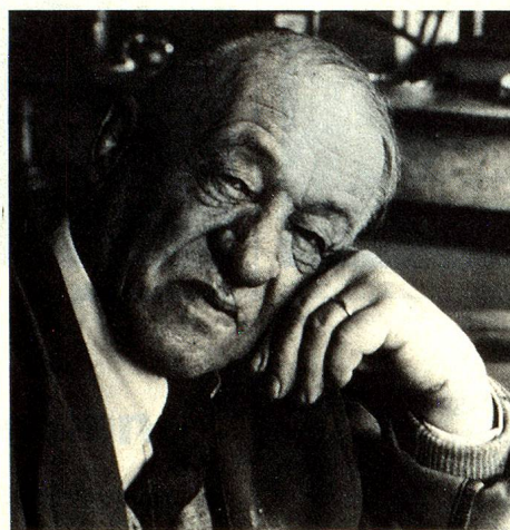
Blaise Cendrars in the 1950s in Paris (photo from the book «Cendrars entdecken», Lenos publ., Basle).

The personality of Blaise Cendrars, with its cortège of legends and mythomaniac fabrications, has for too long eclipsed a genuine work of artistry, probably one of the most representative of our century.