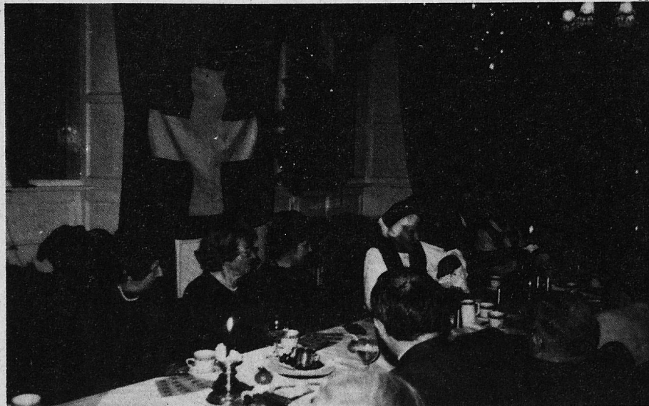
Christmas Party – Paignton