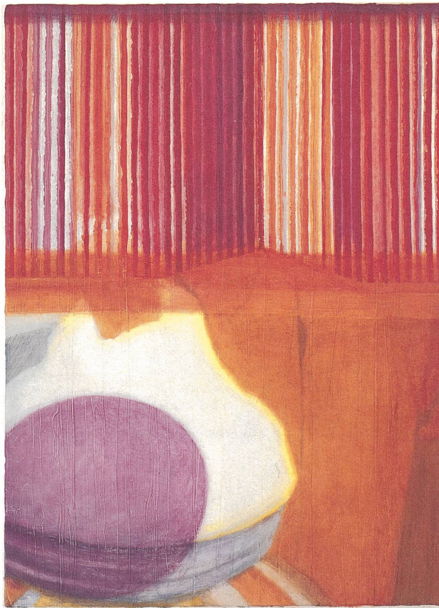
1998, 110×80 cm 1998, 60×150 cm