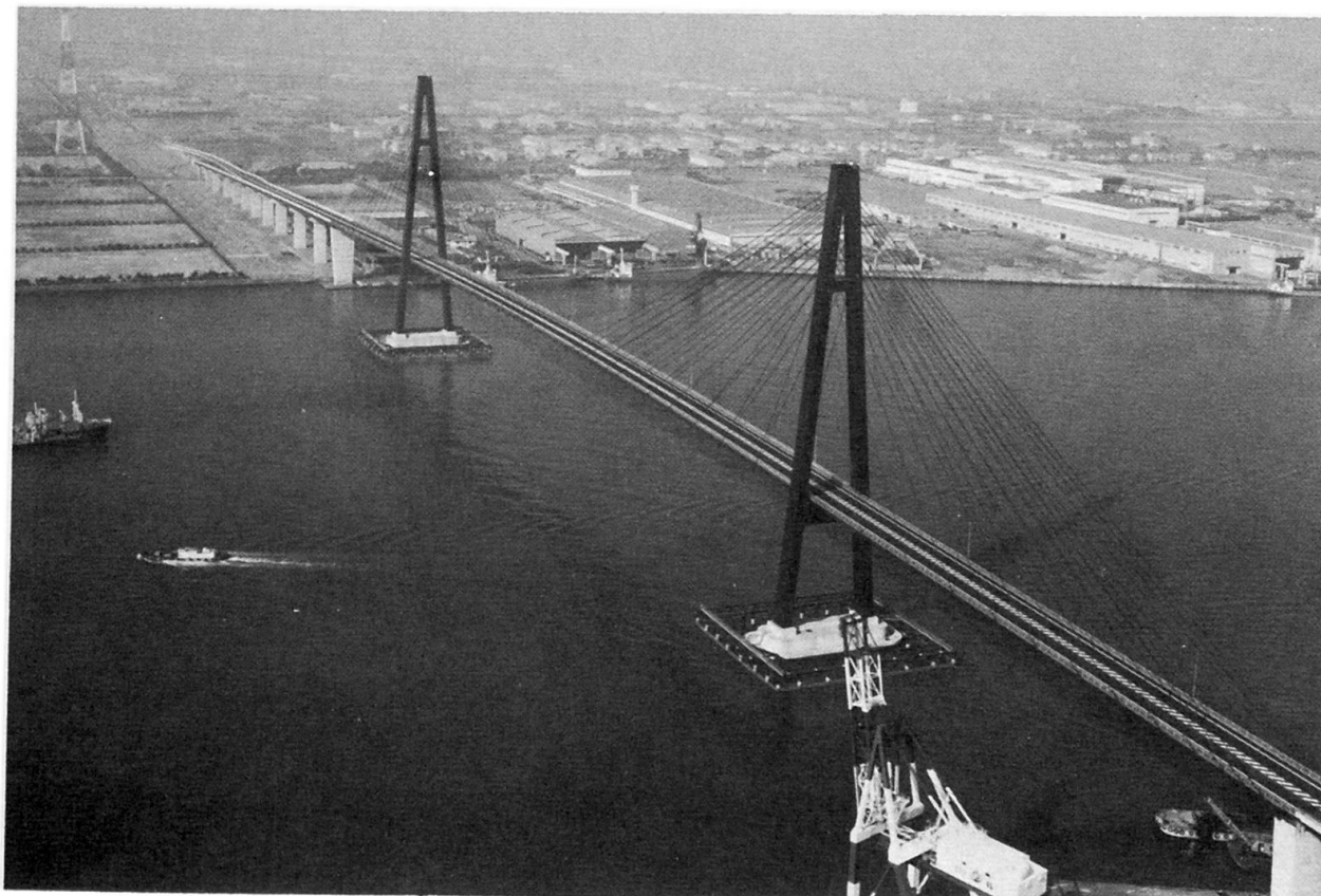
Meiko-Nishi Bridge, Nagoya

This bridge is a steel cable-stayed bridge with three spans of (175 + 405 + 175 m). The box-girder type with an orthotropic deck is a trapezoidal 3-cell box-section of depth of 2.8 m. Towers are A-frames fixed to piers. The longitudinal cable configuration is the fan type of twelve stay cables.